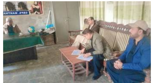
Government Boys Elementary School Manthar Otho