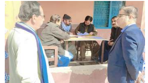
Government Boys Elementary School Shah Baig Lund