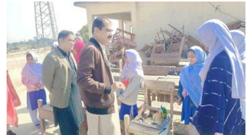
Government Girls Higher Secondary School Chambar