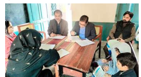
Government Girls Primary School Piyaro Lund