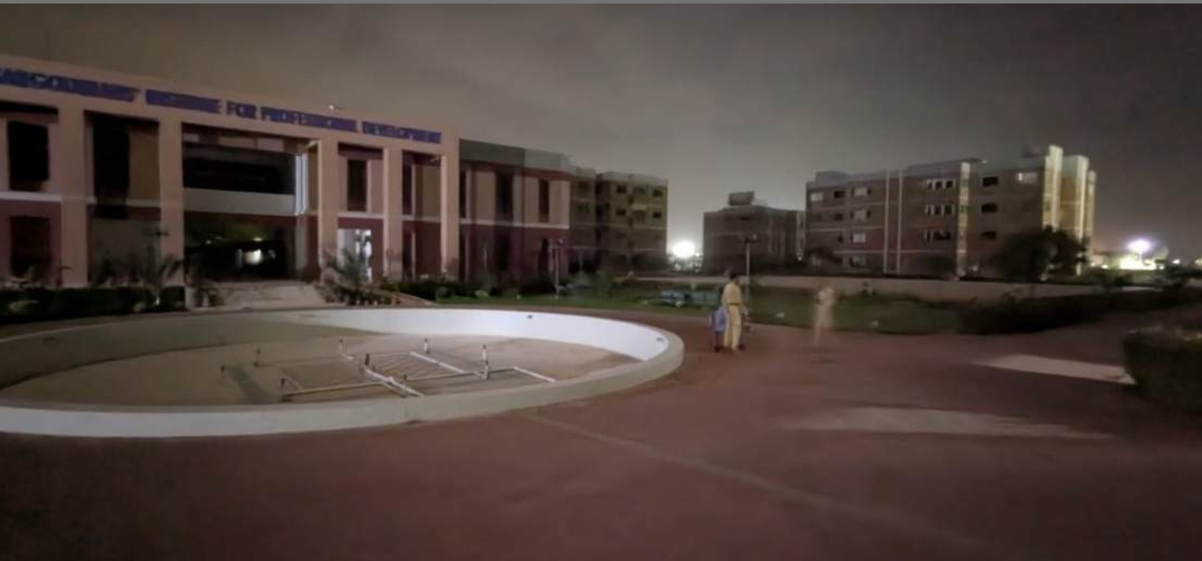
Give an hour for Earth at SIPD