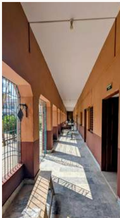
Corridor Before & After