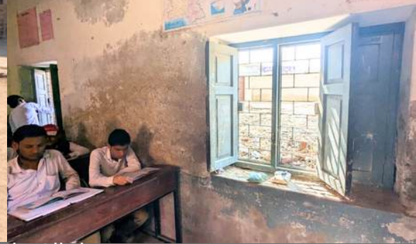
Government Boys High School Main Sindhi, Tando Allahyar