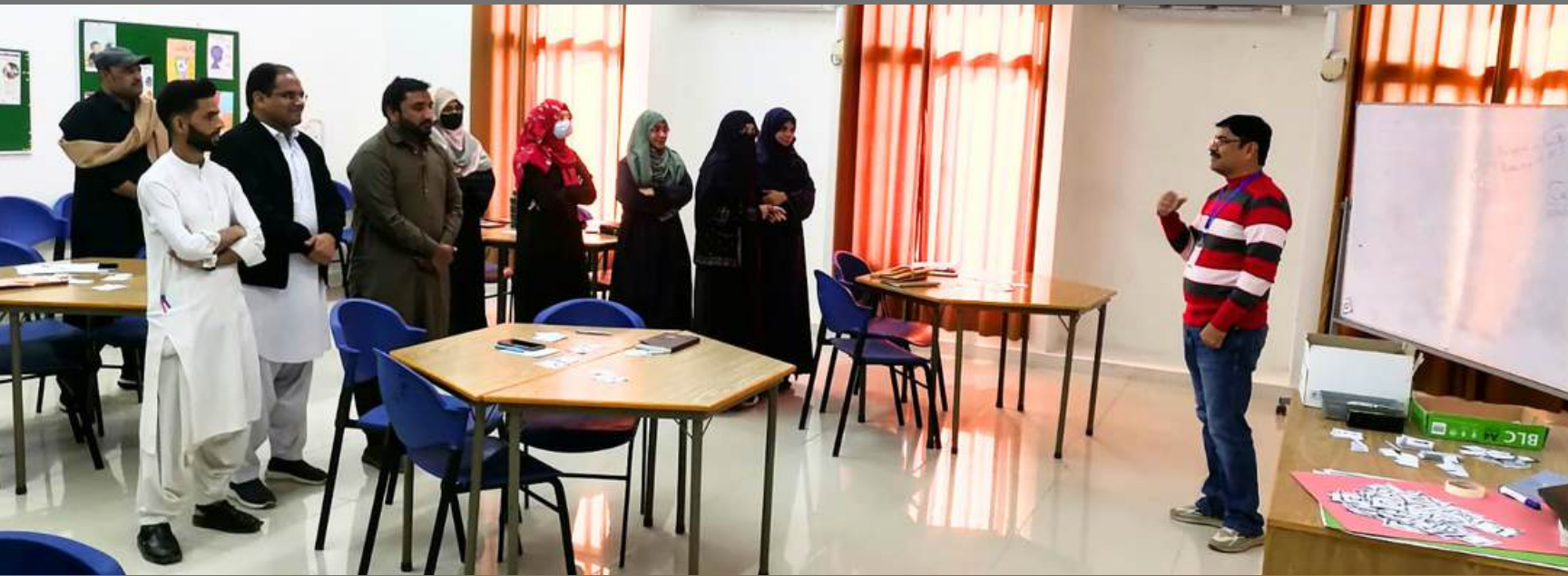
Session on ECCE Diploma Program