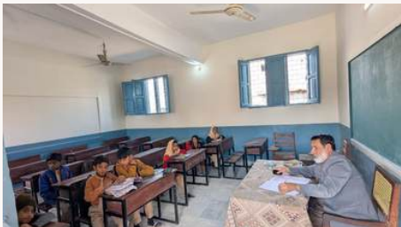
Classrooms Before & After