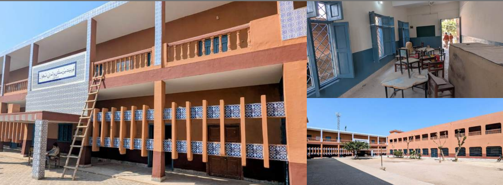
Government Boys Elementary School (GBELS) Main Sindhi in Tando Allahyar