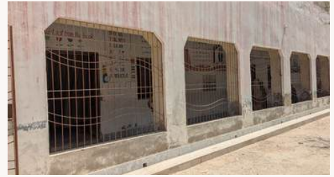
Out side Corridor Before