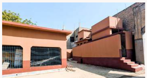
Out side Corridor After