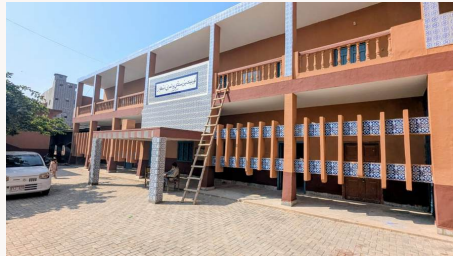
Main Entrance of the school Before & After