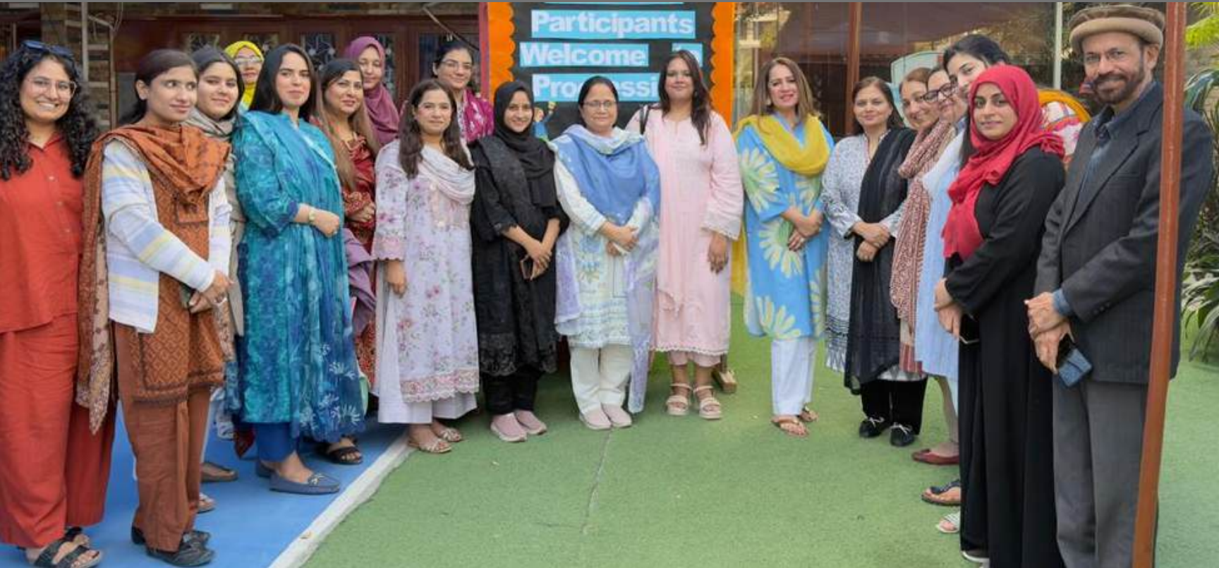
ToT on Inclusive Education – Group photo, January 2026