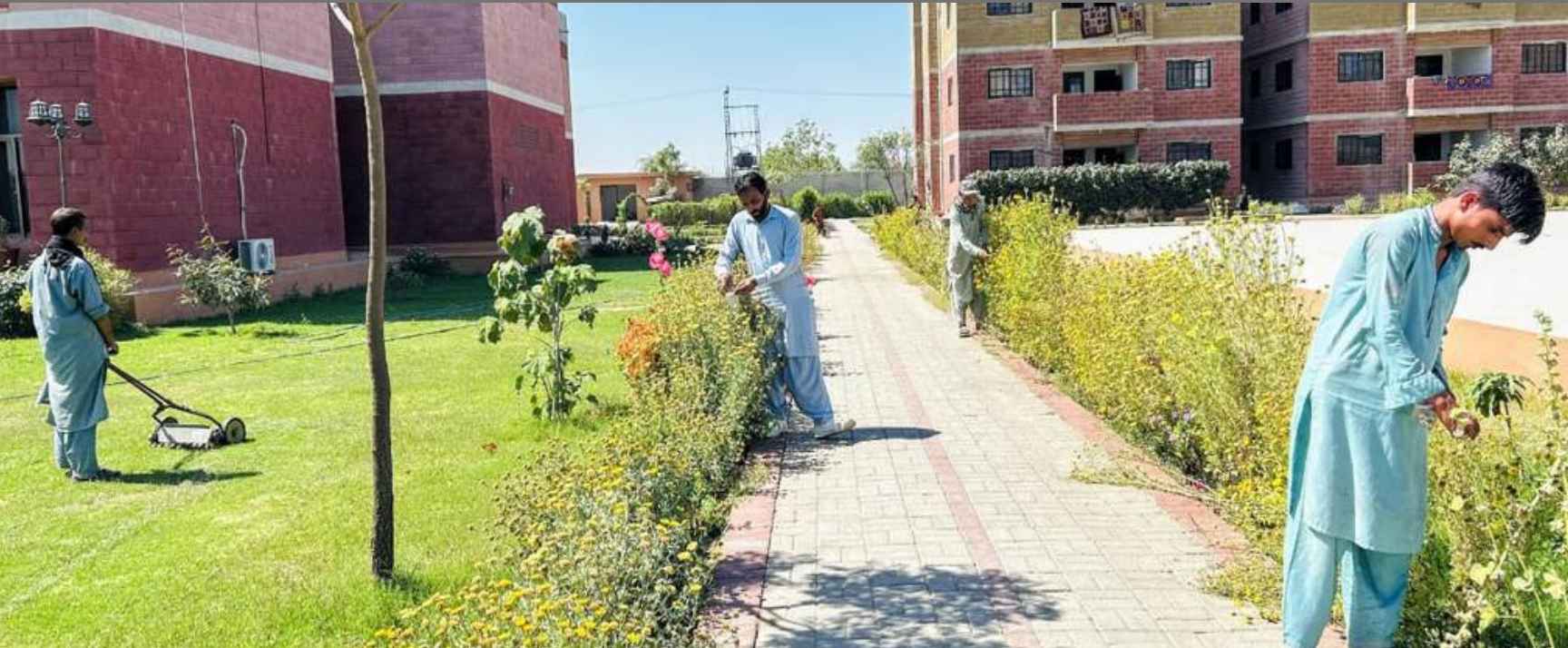
Keeping SIPD Green – Garden Maintenance in Action